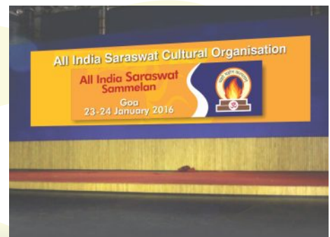
Dr. Shyama Prasad Mukherjee Stadium